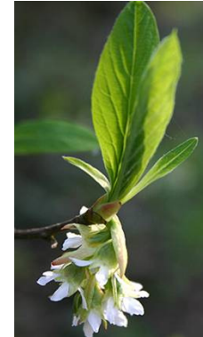
Oemleria cerasiformis (Indian Plum)

It is still blustery outside, but the budding plants tell us that spring is around the corner! We have spent the winter developing conceptual plans for new habitat restoration projects, as well as continuing to assist local governments with important planning projects. Our biologists are gearing up for the field season and have been setting up a new and improved laboratory space for processing juvenile salmon prey samples.